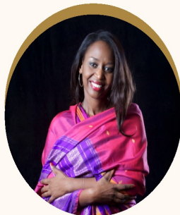
BEST SELLING AUTHOR AND RWANDAN GENOCIDE SURVIVOR