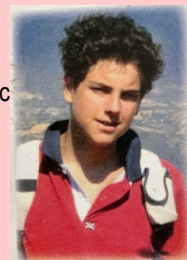
Blessed Carlo Acutis BORN: May 3, 1991 DIED: October 12, 2006 BEATIFIED: October 10, 2020

This exhibit, to be displayed in Podowski Hall at our Lucernemines worship site, is a physical presentation of the Eucharistic Miracles website created by Blessed Carlo Acutis. Carlo Acutis was an Italian Catholic youth and website designer, who is best known for documenting Eucharistic Miracles around the world and cataloguing them onto a website which he created before his death in 2006 from leukemia at the age of 15. He was noted for his cheerfulness, computer skills, and deep devotion to the Eucharist which became a core theme of his life. Carlo Acutis was beatified on October 10 th , 2020, and is currently being considered for canonization. This Exhibit is accompanied by a first class relic of Blessed Carlo Acutis. Admission is free. Resources will be available for children and teens. Plan to stop by and learn more about the Eucharistic Miracles our Lord has worked in the world! Watch our bulletin for more details!