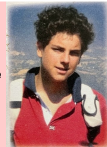
Blessed Carlo Acutis BORN: May 3, 1991 DIED: October 12, 2006 BEATIFIED: October 10, 2020

Friday, June 9 th from 5pm-8pm Saturday, June 10 th from Noon until 8pm Sunday, June 11 th from 10am-3pm